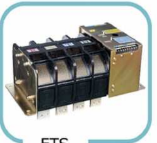
ETS MODEL: Y, B TYPE