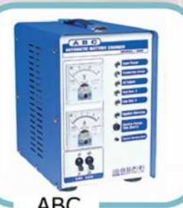
ABC MODEL: SMF