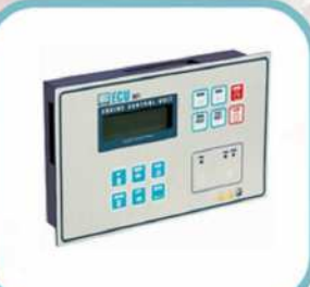
ECU MODEL: DG1