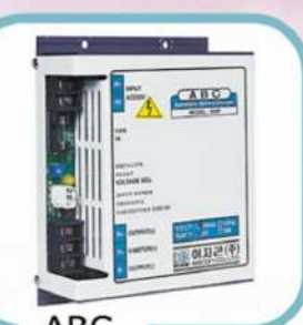
ABC MODEL: SMP